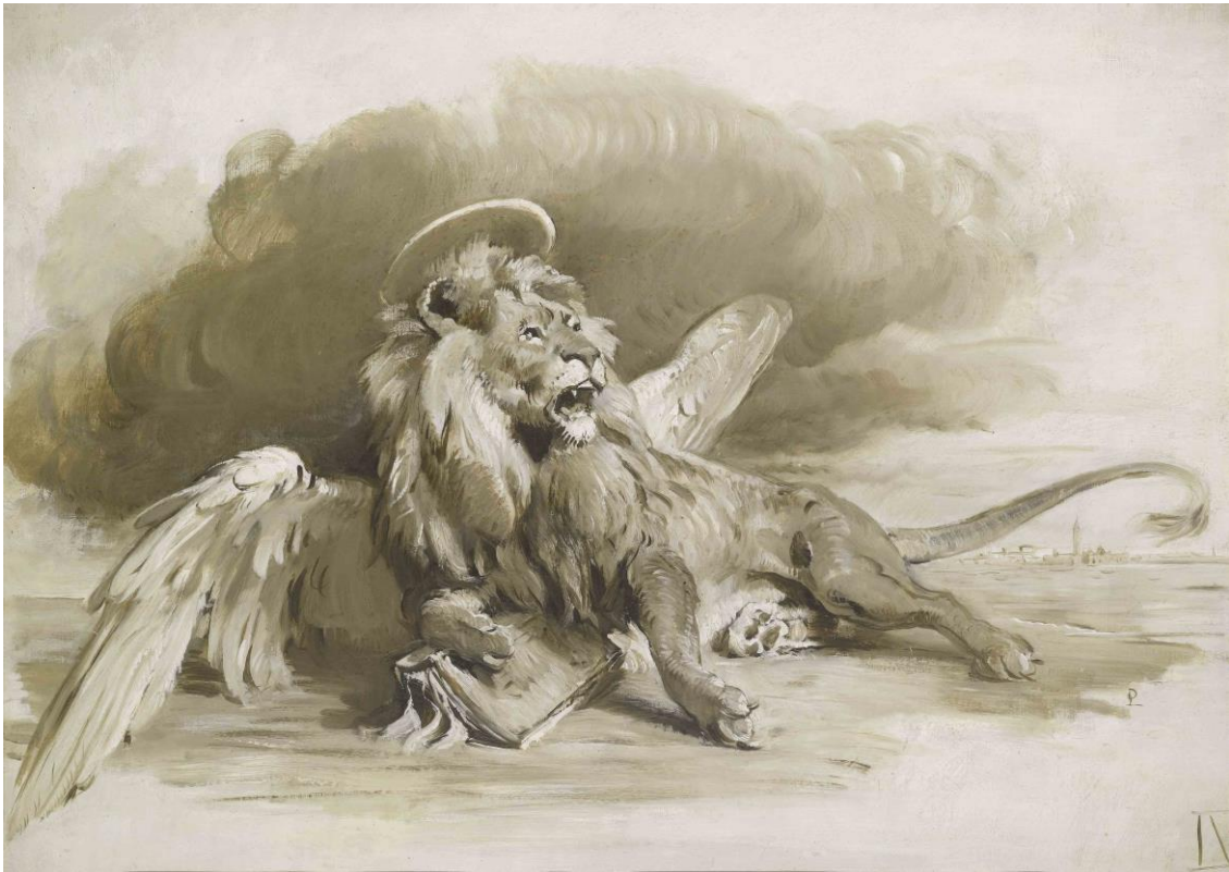
Allegory of the Venetian Republic Oil on paper 46 x 64 cm.

Lodovico POGLIAGHI (Milan, 1857 – Varese, 1950)